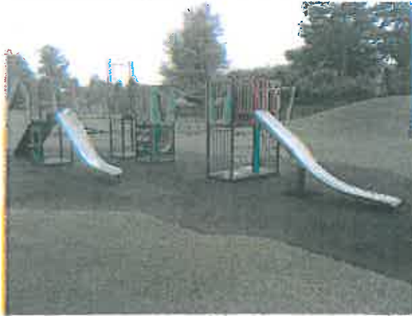
Wicksteed Multiplay unit.